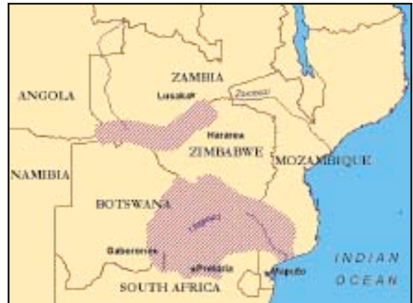
Tanzania/Kenya coastal zone

The “ridge-to-reef” project will work in collaboration with an exciting effort recently launched by the United Nations Environment Programme (UNEP) to use high-resolution data sets of the Mt. Kilimanjaro region to better monitor global change. This mountain is at the headwaters of the Shimba Hills watershed that empties into the ocean via the Tsavo River near Malindi, Kenya. Inclusion of the entire Tsavo watershed provides a unique opportunity to demonstrate the “ridge-to-reef” approach to coastal and watershed management. It also provides another opportunity to address transboundary resource management issues, tourism and ecosystem management, and even such important global issues