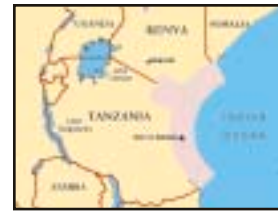
Tanzania/Kenya coastal zone