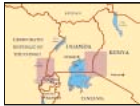
African Great Lakes region