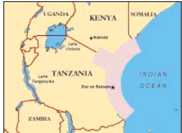
African Great Lakes region

Human and animal health problems, such as schistosomiasis, Rift Valley fever, and malaria, are often closely linked to irrigation, land use change, and water resource use. Furthermore, many of these diseases are becoming more virulent, and drug resistance is increasing. Several ongoing USAID projects in the region offer test beds for capacity building, data enhancement, and sharing of lessons learned on the use of geospatial tools in disease prevention and management. For example, the Global Livestock CRSP's Livestock Early Warning System (LEWS) project focuses on animal health issues; the Agroforestry Research Network for East and Central Africa (AFRENA)/Africare project, which is also linked to the African Highlands Initiative (AHI), has focused on hillside erosion and other agricultural land use changes; and a collaborative project between Louisiana State University, the Centers for Disease Control and Prevention (CDC), the World Health Organization (WHO), and Mud Springs Geographers, Inc., is using GIS tools for studying health-related issues, such as schistosomiasis, Rift Valley fever, and malaria, to improve decision making, management, and prevention.