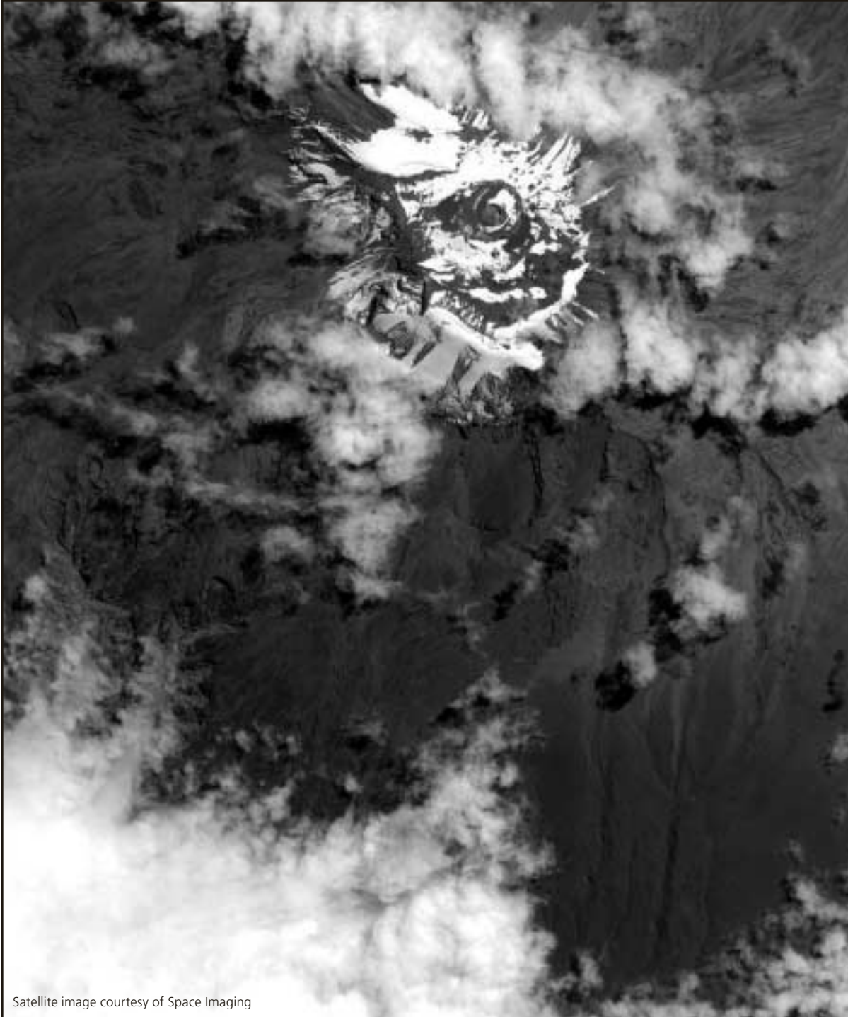
Satellite image