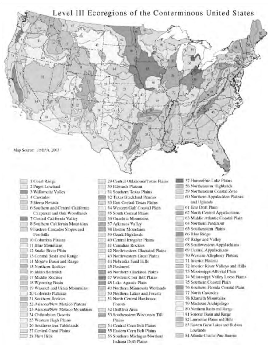
Figure 1. Level III ecoregions of the coterminous United States (U.S. Environmental Protection Agency 2006).

mechanisms of gene flow connecting subpopulations are pollen movement and seed dispersal. Metapopulations are important because they are much less likely to go extinct than an individual subpopulation. Additionally, metapopulations are the units upon which evolutionary forces operate (Ehrlich and Raven 1969).