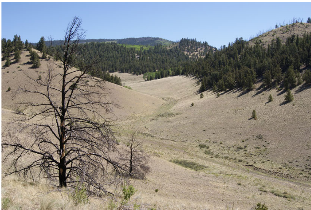
Figure 3. High variation in bristlecone pine stand structure and recent disturbance over short spatial distances in the Cochetopa hills of southern Colorado. This small drainage contains isolated fire-scarred bristlecone pines bordering montane grasslands, a recent (2007) 21-ha., mixed-severity burn and evidence of small patches of historic stand-replacing fire in mixed bristlecone pine, Douglas fir, and spruce stands on more densely forested summits.

pine fire regimes in the southern Rocky Mountains. The Badger Mountain (near South Park) and Maes Creek (in the Wet Mountains) fires, also occurring following extremely dry conditions in 1978, led to near-complete mortality in many bristlecone pine stands (Coop & Schoettle 2009). In 2000, the 11760-ha Viveash Fire was primarily a moderate- or high-severity fire in ponderosa pine, mixed conifer, and spruce-fir forests in the southern Sangres. However, the fire was less severe where it entered bristlecone pine stands in the headwaters of Cow Creek. Many of these stands are very open and intermixed with subalpine Festuca thurberi grasslands on steep, south-facing slopes. Only scattered