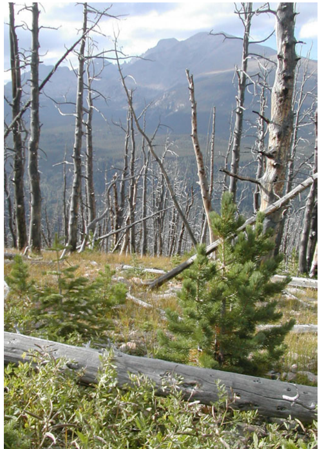
Figure 4. Recent post-fire limber pine seedling establishment in the interior of the 1978, stand-replacing Ouzel burn, Rocky Mountain National Park, northern Colorado.

data). Thus, rather than any change in dispersal mechanism, variation in post-fire regeneration pattern across these three burns appears more likely related to some fundamental shift in limber pine physiological performance that may be also correspond with the elevational shift across the southern Rockies described by Peet (1978).