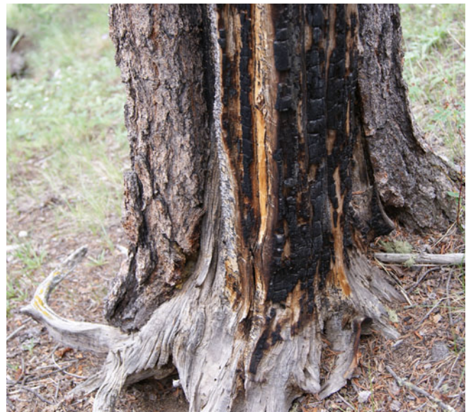
Figure 2. Fire-scarred bristlecone pines near Bobcat Pass in the Sangre de Cristo range, northern New Mexico.

While stand-replacing fire may have been prevalent in some settings, at least some stands may be best characterized by a low-severity fire regime. Fire-scarred bristlecone pines in open, low-density stands with grassy understories occur nearly throughout the range of the species, particularly where stands abut montane and subalpine grasslands, such as around South Park, in the Cochetopa Hills, the Wet