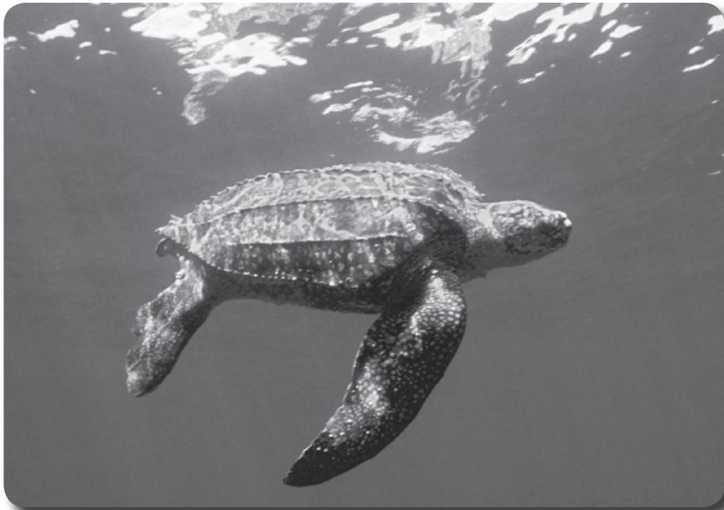
Figure 2 —The leatherback sea turtle is the largest marine reptile.

Last November, the United Nations Food and Agriculture Organization (FAO) held a Technical Consultation on Sea Turtle Conservation and Fisheries, and provided voluntary technical guidelines to reduce sea turtle mortality in Fishing Operations (FAO 2004). Bolder measures have been implemented in the United States, where aggressive litigation has resulted in increased regulation of U.S. longline vessels, limitations on incidental captures, and a four-year closure of the Hawaii swordfish longline fishery (Turtle Island Restoration Network and others versus National Marine Fisheries Service, 340 F.3d 969, 9th Cir. 2003). Fisheries research is being carried out to attempt to improve certain fishing technologies and practices, such as the use of "circle"