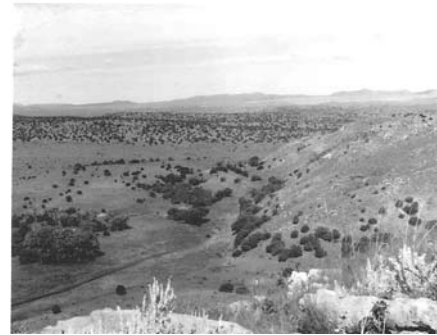
Figure 1. These photographs were taken from the same location looking westward from atop the Twin Mountains along the Cienega del Macho at the headquarters of the Three Block Ranch.

photograph. After all, this rangeland had been stocked with cattle for less than 25 years and, although altered, the period of time had been short enough that the negative impacts were not yet fully manifest. Fire was eliminated from this plant community, and thus, no pyric control on woody plants has operated for at least 85 years. This resulting landscape is not in balance with historic ecological forces that included recurrent fire. Our challenge is to restore these natural forces.