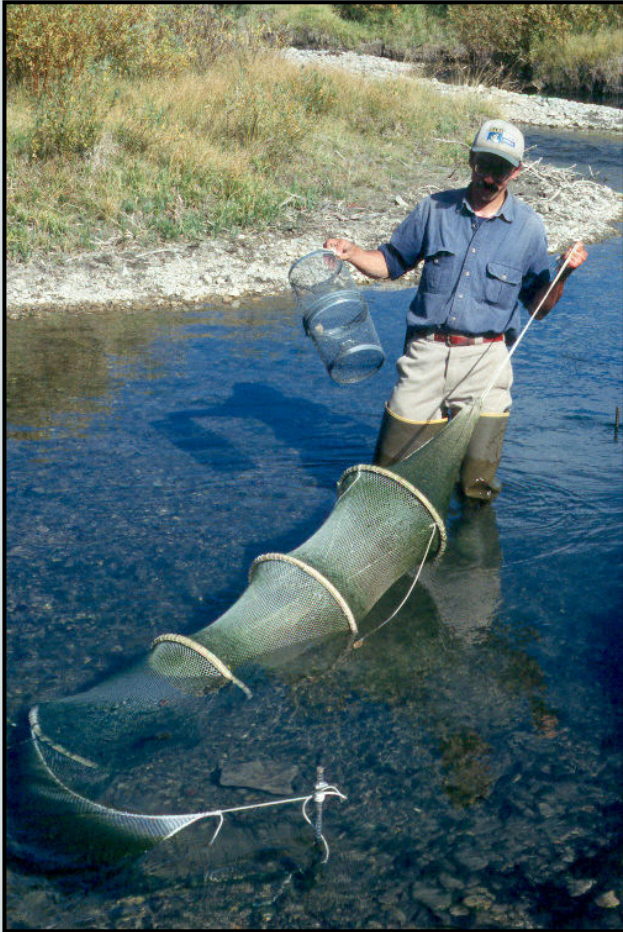
Figure 1. Hoop nets containing enclosures seeded with mature brook trout were effective in capturing large numbers of adult brook trout.