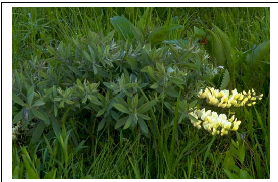
Cream Wild Indigo

The state nursery will grow 50,000+ plant plugs from the seeds provided by Midwin for a cost of $50,000. The plants will be grown during the winter months of 2006. The plugs will be planted at Midwin in restorations and in seed production beds during the spring months. Seed produced from these plants will be used for restoration in the future. Volunteers will provide most of the labor, planting the plugs and harvesting the seeds in the future.