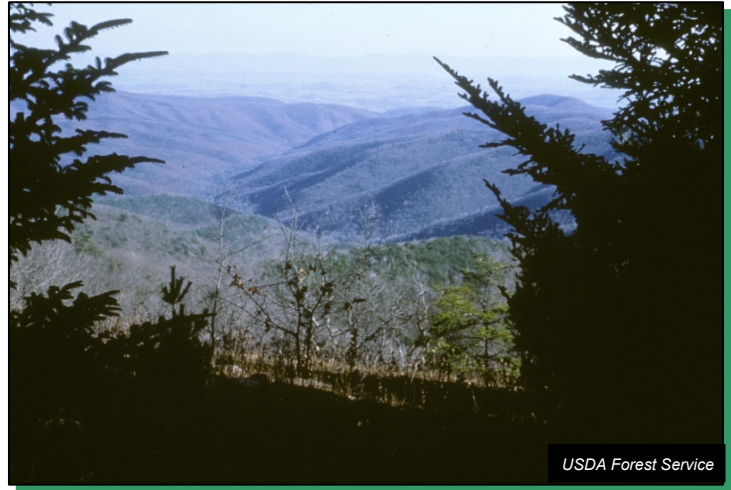
USDA Forest Service

Virginia's forests cover 15.4 million acres, about two thirds of the state's land area. The majority of the state's forested land, some 10 million acres, is in non-industrial private ownership, while approximately 1.4 million acres are in national forests. Virginia's forests are prized for their scenic beauty, supporting tourism and outdoor recreation and providing wildlife habitat from the Appalachian Mountains to the lowlands of the Atlantic Coastal Plain. Major forest types in the state include oak-hickory, loblolly-shortleaf pine, and mixed oak-pine. Other minor types account for 6% of the acreage.