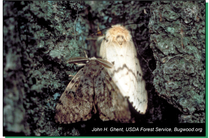
John H. Ghent, USDA Forest Service, Bugwood.org

Southern pine beetle (SPB) activity remained low in Virginia in 2007 with only 64 spots detected in 7 counties. About 820 acres were killed. Most of the activity was in Chesterfield and Mecklenburg Counties. The Virginia Department of Forestry has implemented a Southern Pine Beetle Prevention Program with federal funding and support which focuses on thinning pine stands to reduce hazard and provides cost-share assistance to landowners.