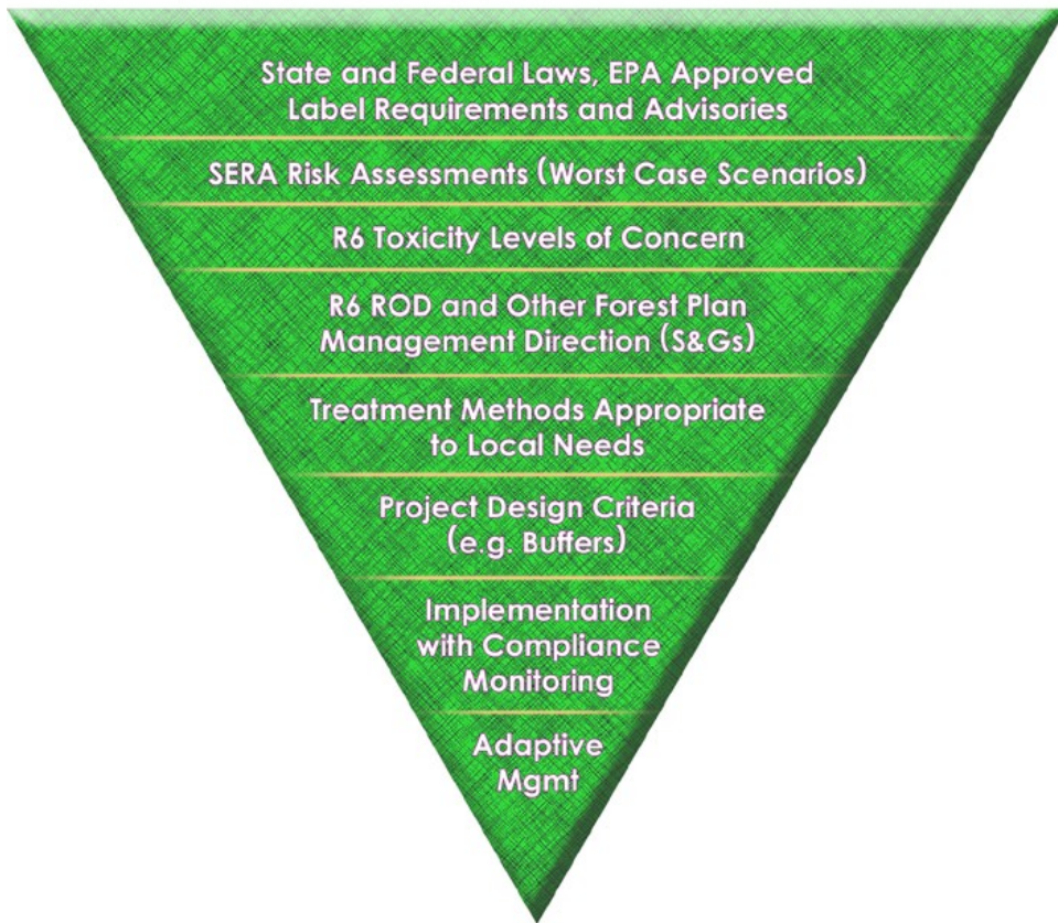
Figure 2. Layers of Caution Integrated into Herbicide Use

In addition to the risk reduction framework, invasive plant treatments will be implemented in conjunction with existing prevention practices (FEIS pp. 18, 60-61, 94, Appendix G). Many public