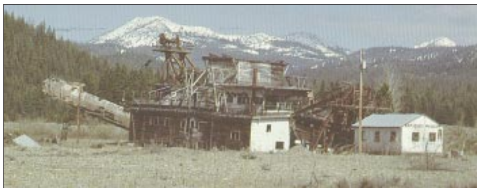
Dredge before 1992.