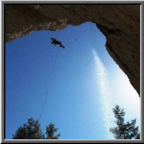
Rock Climbing in Maple Canyon

beautiful La Sal Mountains , which provide an island of cool green towering above the red rock deserts of Moab. American Indians revere many sacred sites in the Abajo Mountains found in the far reaches of southeastern Utah.