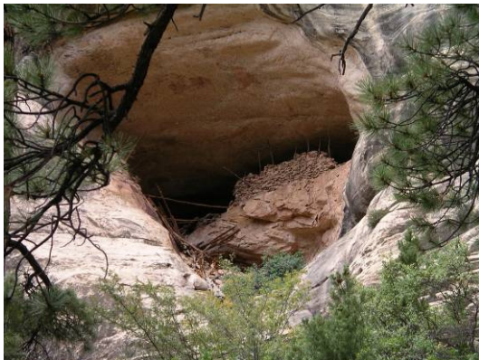
Grainary near Blanding, Utah

This area of Utah is rich in ancient artifacts. The area is littered with pieces of pottery, stone, fiber and bone that tell the story of people who lived a thousand years ago. Rock cliffs hide granaries and ancient dwellings. Rock faces are often galleries for pictographs and petroglyphs. Archeological surveys indicate there are more prehistoric artifacts on the Manti-La Sal National Forest than any other national Forest.