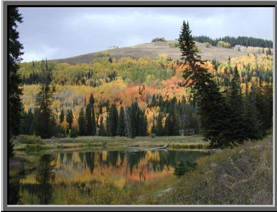
Lake on the Manti La Sal NF

Whatever your location on the Manti-La Sal National Forest , you are at a starting point for adventure. Within a few minutes drive you can be in the Forest or traveling picturesque sandstone deserts.