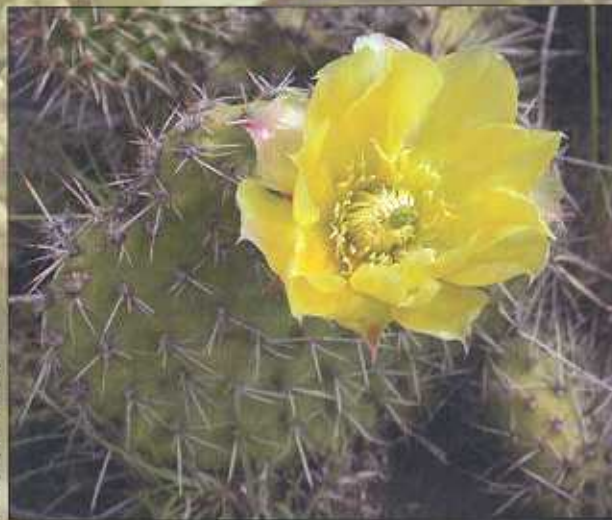
Prickly Pear in bloom

The passage through this hot, narrow canyon must have been disconcerting to the explorers. Expressing his fears, Lewis wrote that surely the river could not have “worn a passage” through every “immence body of solid rock,” as it had through the Gates. Luckily, on the following day, the Corps “passed through a range of low mountains and the country became more open again.” Their campsite that evening presented new challenges. “The prickly pears,” wrote Lewis, “are so abundant that we could scarcely find room to lye.”