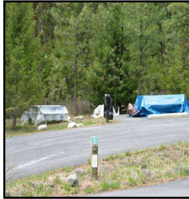
Cover facilities with plastic or wash after treatment application

To reduce human exposure to the insecticide, personal protective equipment (see label) must be worn during application. A hard hat with a face shield, rubber gloves and disposable clothing are recommended. Picnic tables, water faucets, etc. should be covered with plastic before application or cleaned with detergent and water following the insecticide application.