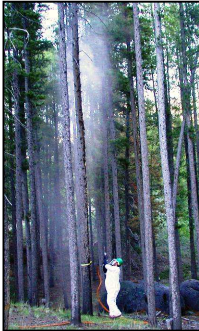
Carbaryl can be used as a preventative spray against future bark beetle attack