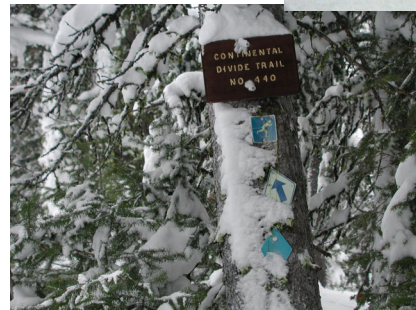
Left: Continental Divide trail in February 2004.