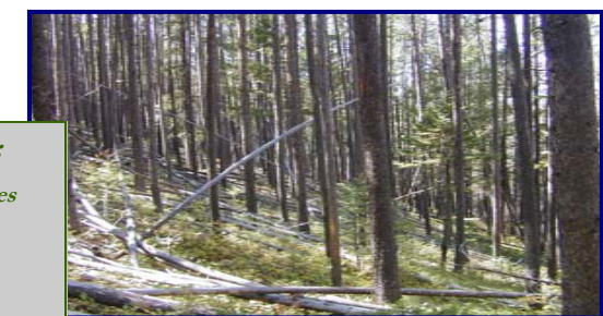
Hazardous fuels reduction and forest health activities are proposed in the Cabin Gulch area to reduce the risk from wildfire and to restore fire-adapted ecosystems.