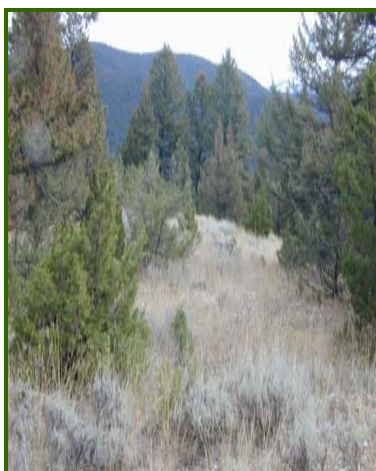
Restoration of sagebrush & grassland meadows would be accomplished using mechanical thinning and prescribed fire.