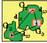
Figure 2 —Dispersal.

Interprets the degree of proximity or distance from the settlement on forestland: the greater the dispersal the greater the separation between the population ( table 3 ).