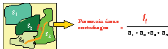
Figure 4—Existence of firewall areas.

This factor is interpreted by analysing the kilometres of firewall which appear for each square kilometre of forestland, it being possible to establish a number of ranges from the result, to which a specific gravity level is assigned (fig.4).