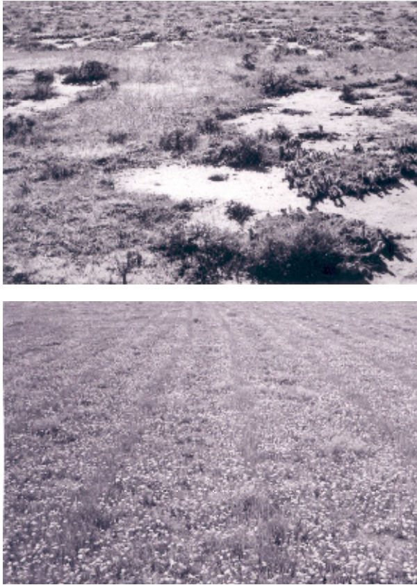
Figure 1 — Photographs of the untreated (above) and treated (contour furrowed) sites in Bowman County, North Dakota.

included plains pricklypear ( Opuntia polyacantha ), Wyoming big sagebrush ( Artemisia tridentata wyomingensis ), spikemoss ( Selagenella densa ), and an unidentified lichen. Breeding birds in the area included the Horned Lark ( Eremophila alpestris ), Chestnut-collared Longspur ( Calcarius ornatus ), Lark Bunting ( Calamospiza melanocorys ), Western Meadowlark ( Sturnella neglecta ), Vesper Sparrow ( Pooecetes gramineus ), Brewer's Sparrow ( Spizella breweri ), and Sage Grouse ( Centrocercus urophasianus ). The first four species are among a suite of declining grassland birds in the region (Johnson and Schwartz 1993, Johnson and Igl 1995, USDOJ 1996). Brewer's Sparrow and Sage Grouse also are declining across the west (Saab and Rich 1997, Connelly and Braun 1997). However, the latter two species are on the periphery of their ranges in southwestern North Dakota whereas the others are widespread in the region (Kantrud 1981).