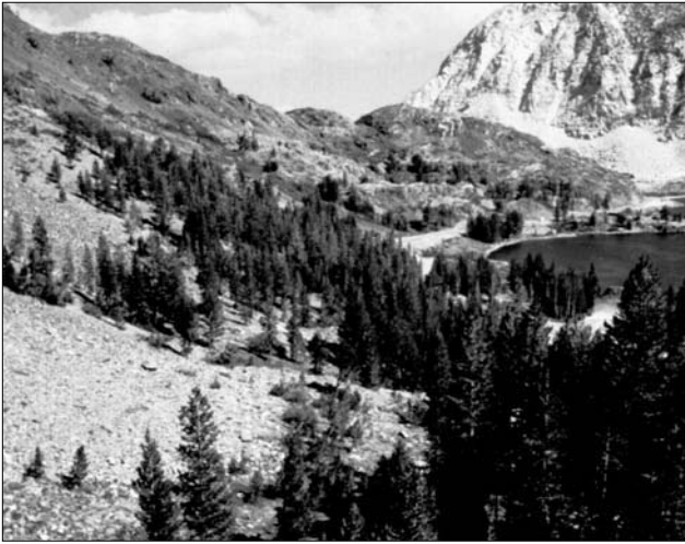
Figure 77—Harvey Monroe Hall, View of typical subalpine landscape representative of the H.M. Hall RNA with Pinus contorta in the foreground. (1982)

with steep headwalls and flats or lakes at their floors. Much of the lower elevation area is stepped topography resulting from differential erosion along jointing planes in the granitic bedrock. The granitic rocks are part of the Cathedral Peak Quartz Monzonite and the Half Dome Quartz Monzonite. They occupy the W. part of the area. The E. portion is underlain by various metamorphic rocks including Paleozoic and Mesozoic metasediments, metacalcite, banded calc-silicate hornfels, calc-silicate hornfels varying to limestone-marble, and basic metavolcanics. Soils are typically shallow and poorly developed except in meadows. The climate is high Sierran montane with copious winter snowfall. Average annual precipitation is estimated to be more than 25 inches (635 mm). There is great variation in temperature and growing season, between S.- and N.-facing slopes, valley bottoms, and so forth.