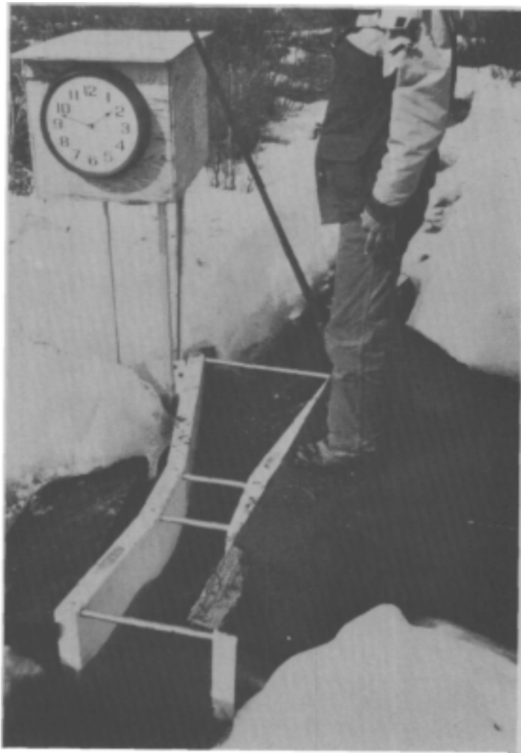
Figure 2.—Parshall flume in C-2 channel; ice surrounds flume in late April. Clock was added for time-lapse photography at the site.

Following successful measurement of summer flow at the C-2 site installation, and its survival of spring breakup, a second 9-inch-throat fiberglass Parshall flume was installed in subdrainage C-3 (drainage area, 5.5-km 2 ). This is also a first-order stream, with a catchment dominated by permafrost as result of its