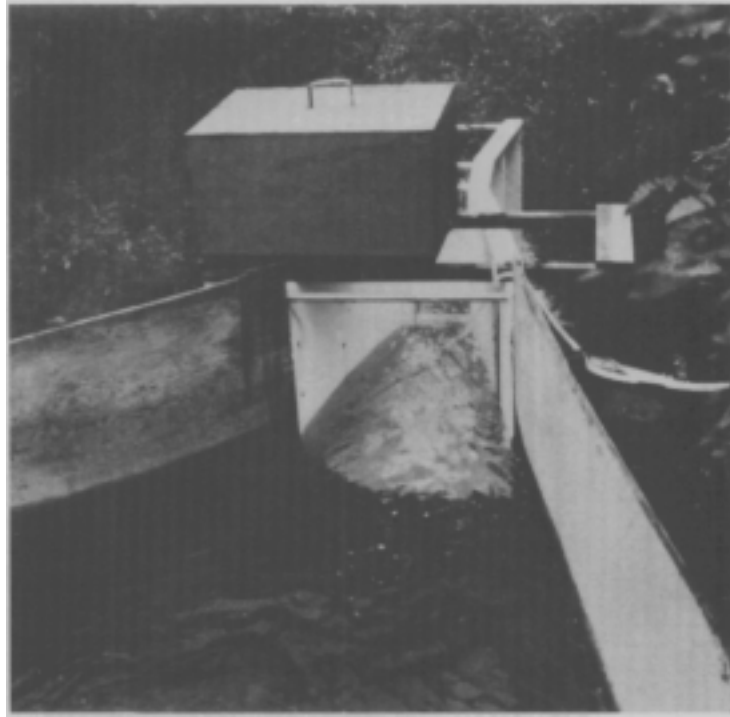
Figure 3.—Parshall flume in C-3 channel, second season after installation. Water-level recorder is in box over stilling well; view is down-stream.

dominant north-northeasterly aspect. Valley soils are Karshner Silt Loam (Rieger et al. 1972). The channel reach chosen was not as attractive in terms of hydraulic characteristics as the C-2 site. Because the channel was wider, more extensive intake walls had to be constructed on the left bank. This installation (fig. 3) was completed in July 1978 and was stable through the remainder of the 1978 runoff season and throughout the spring 1979 breakup and subsequent summer.