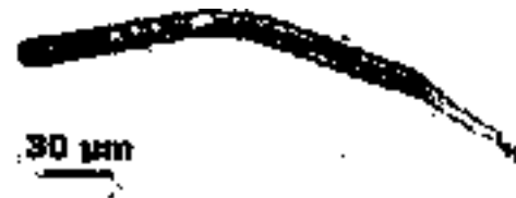
Figure 3. Ascus of Hydnopticata convolute in Melzer's reagent.

The subsequent molecular phylogenetic studies of Peziza sensu lato by Hansen et al. (2001) demonstrate that genus to be non-monophyletic. Their study included the species we have discussed here as Peziza whitei , represented by a collection from East Gippsland, Victoria (Trappe No. 17049).