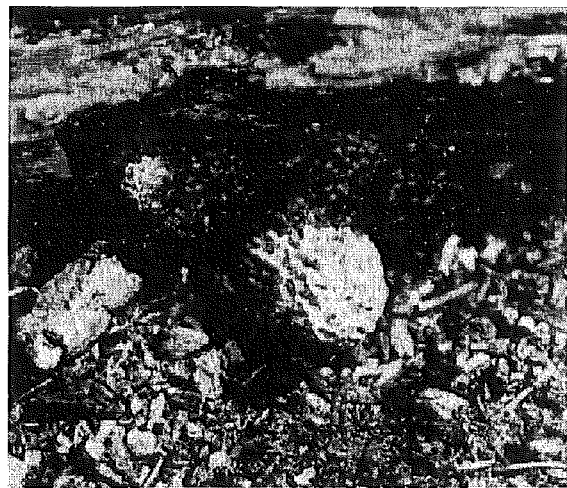
Fig 6 Gray morels growing in the shade of a log.