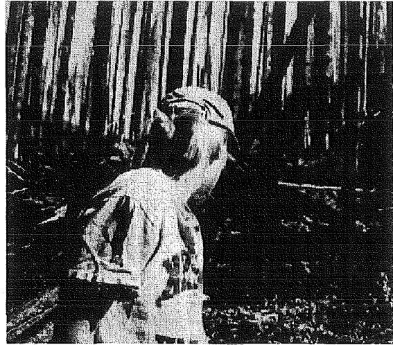
Fig 3 Wildfire-burned forest habitat of gray morels.