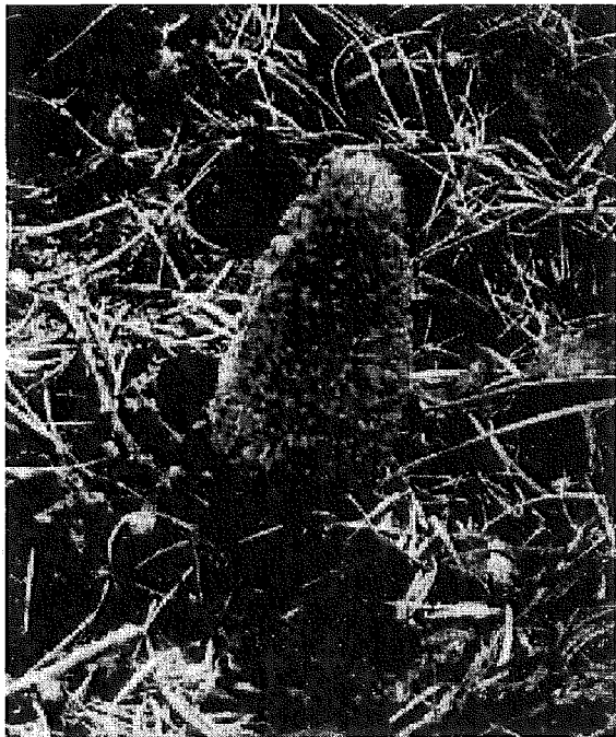
Fig 5 Gray morel growing in the "red needle zone."