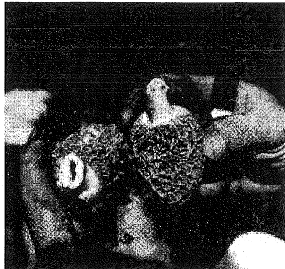
Fig 4 Freshly harvested gray morels with thick flesh.