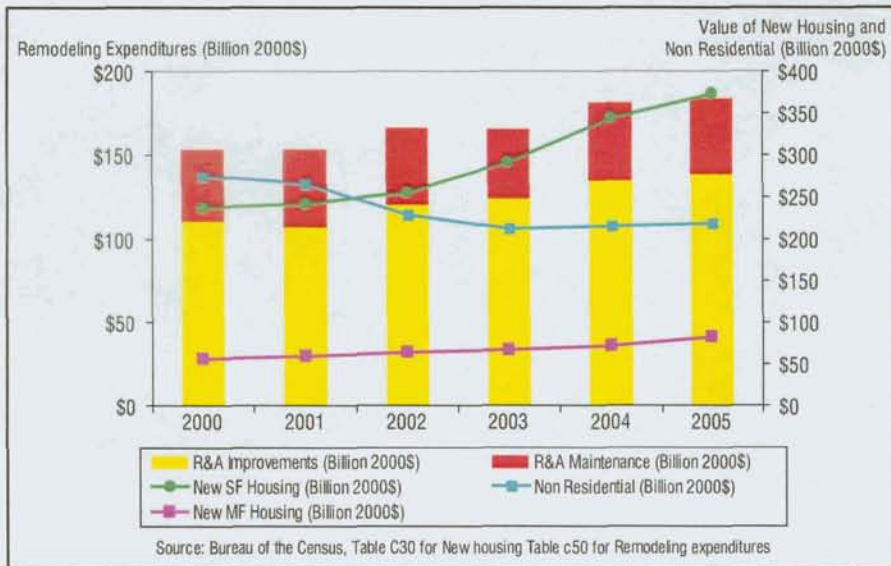
Figure 1. Private Construction Expenditures: Single-family has been the star in construction markets for the past decade.