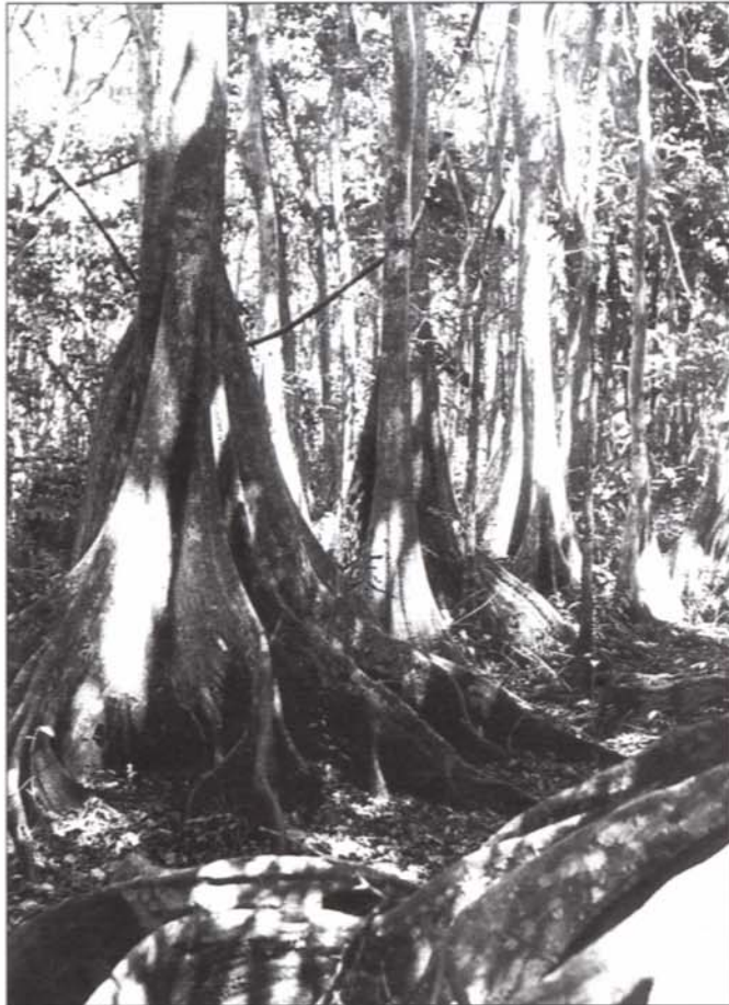
Figure 1.— A bloodwood ( Pterocarpus officinalis Jacq.) tree in a coastal wetland near Dorado, Puerto Rico.

Pterocarpus officinalis Jacq., called palo de pollo in Puerto Rico, bloodwood in Guyana and Panama, and by numerous other names throughout its extensive range, is an evergreen tree that reaches 40 m in height and 60 to 90 cm in diameter at breast height (d.b.h.) at maturity (35, 57). Bloodwood's large, narrow, sinuous buttresses (figs. 1, 2) aid identification in the field. Other useful identifying characteristics are: very light wood; dark-red latex that exudes from cuts in the bark; large, alternate, odd pinnate leaves; and flat, round, winged seedpods (35). Bloodwood grows mainly in coastal wetlands including freshwater and brackish