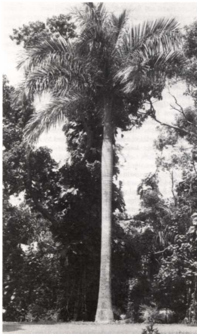
Figure 1. — A transplanted Puerto Rican royal palm ( Roystonea borinquena ) in a roadside environment.

orders Ultisols, Alfisols, Inceptisols, and Oxisols are important habitat. Common parent materials are limestone and weathered igneous rock. The most aggressive natural reproduction in advanced secondary forests occurs on slopes and in valleys of moist limestone hills; Puerto Rican royal palms may have been largely restricted to this habitat before large-scale forest cutting was begun (8). They may also exist in natural stands at the periphery of fresh-water wetlands. In drier areas of its range, the species often grows