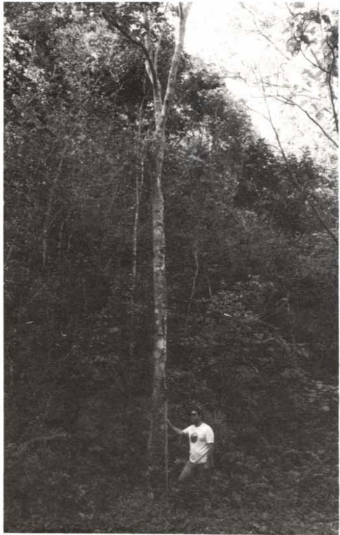
Figure 1.—Guara tree ( Cupania americana ) growing in a secondary forest in Puerto Rico.

In the Sierra Maestra Mountains of Cuba, guara was a minor component in stands dominated by Andira inermis (W. Wright) H.B.K., Calophyllum brasiliense Camb., Cecropia peltata L., Hibiscus sp., Oxandra lanceolata (Sw.) Baill., Persea sp., and Prunus occidentalis Sw. (18). In western Cuba, guara grows in mixed stands with Roystonea regia (H.B.K.) O.F. Cook, Cupania glabra Sw., and C. macrophylla A. Rich. (12). Guara was noted as a component of a young secondary stand in Puerto Rico dominated by Hymenaea courbaril L. and Bucida buceras L. (7). A mesic forest with limestone parent material in central Puerto Rico had a minor component