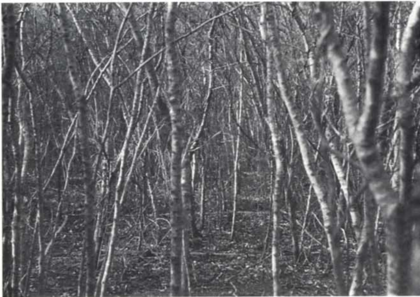
Fig. 2. A dense stand of Leucaena leucocephala along the airstrip on Mona Island.

Each piece of dead wood was split open and examined for any signs of termite activity. Termite galleries, termite fecal pellets, and/or body parts were noted as evidence of former termite activity. When live termites were observed, every attempt was made to collect the entire colony into 85% ethanol. Each entire colony collection was