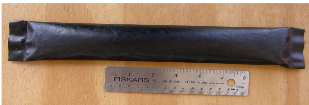
Phero Tech UHR Ethanol (2007)