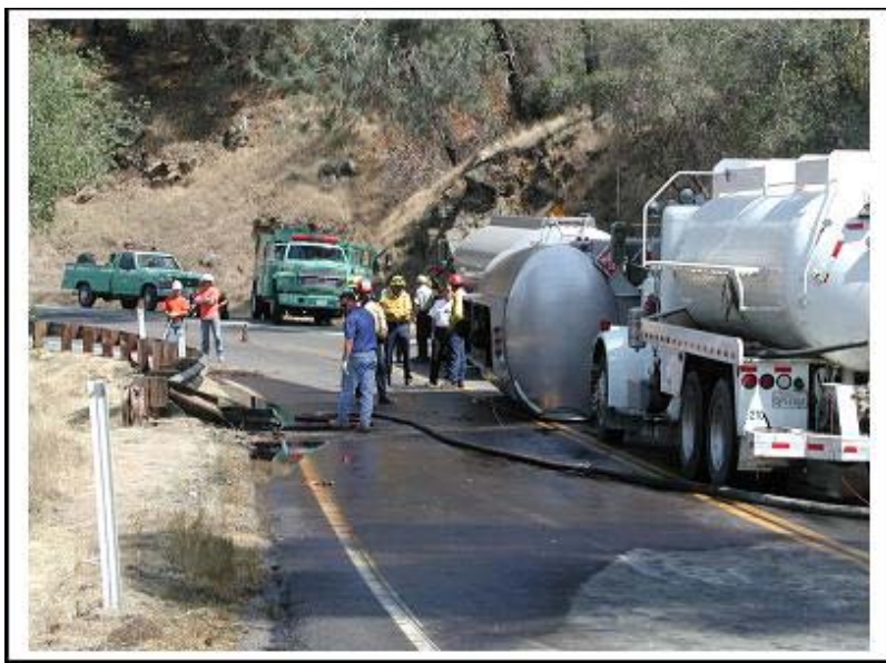
Forest Service employees arrive on scene and assist with tractor-trailer diesel hazmat accident.