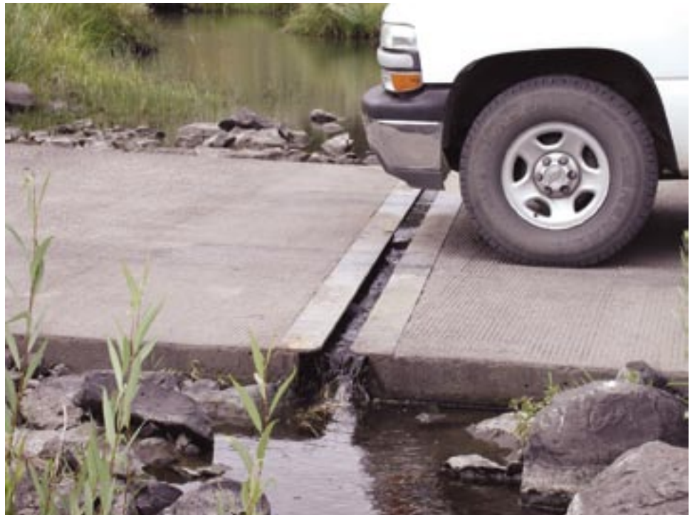
Figure A56. View of the slot with gravel bottom, August 2006.

Thomas Creek is susceptible to scour, so 24-inch-deep cutoff walls on the upstream and downstream sides were part of the design (figure A57b).