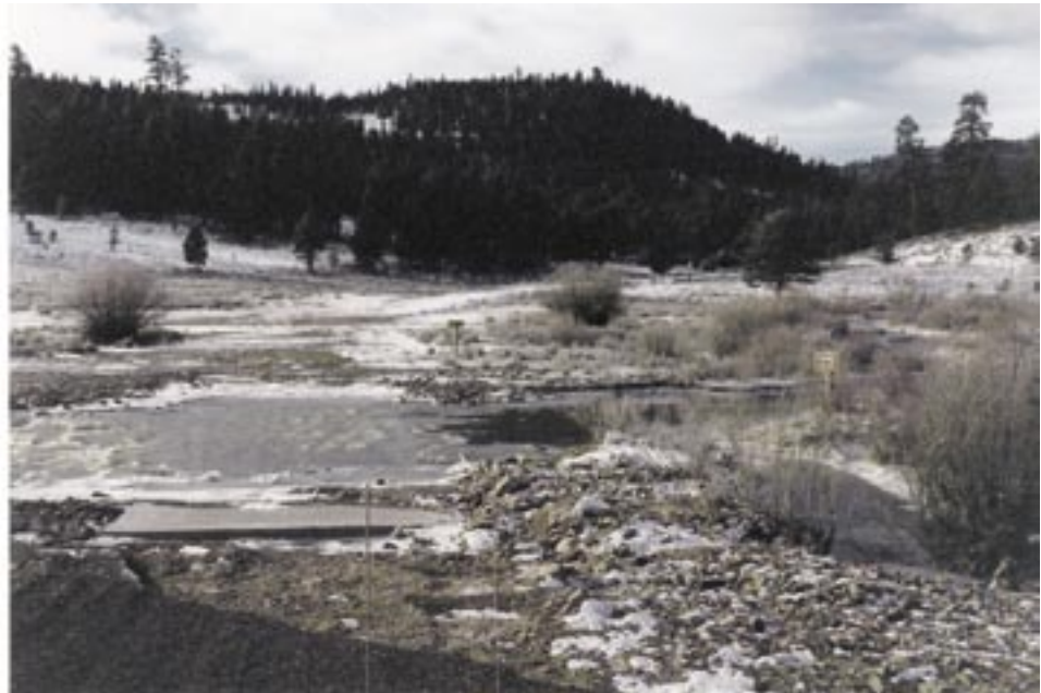
Figure A59. Shortly after the 1997 New Year's Day flood. Some gravel washed from the approaches (in foreground) was the only damage from the largest flood on record.