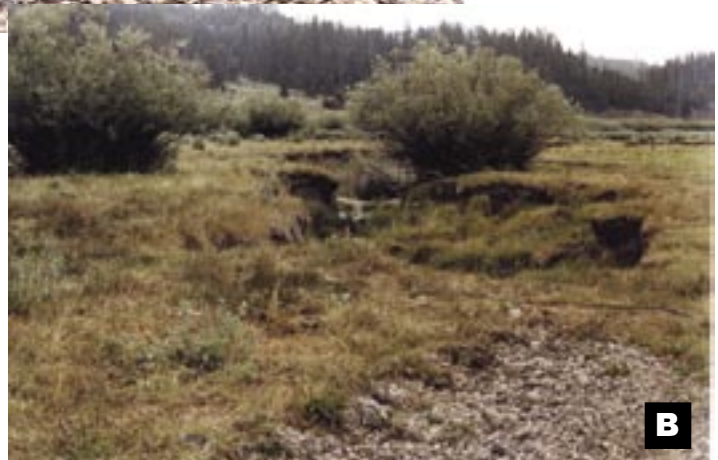
Figures A54a and A54b. Thomas Creek in 1988 as seen from the ford (a) looking upstream of the crossing (b) downstream of the crossing.