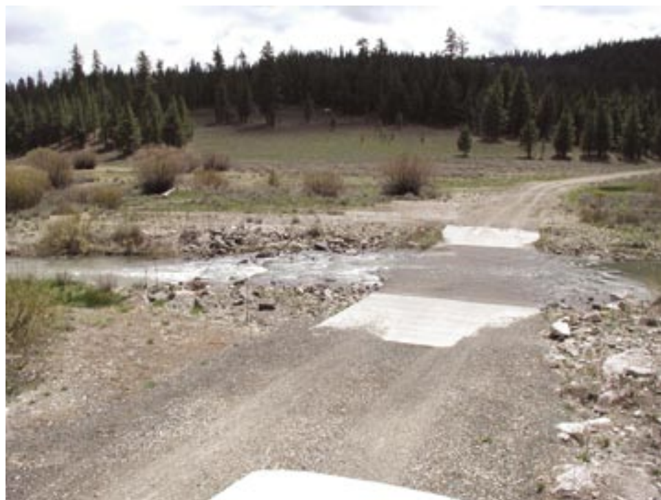
Figure A53. Spring flow over the Mesman slotted ford.

Hydrology: Thomas Creek is a near-perennial stream with peak flows during spring snowmelt runoff, and low summer flows (less than 1 cubic foot per second). Watershed area above the crossing is approximately 20 square miles. Most years, high flows submerge the structure at least 1-foot deep (figure A53).