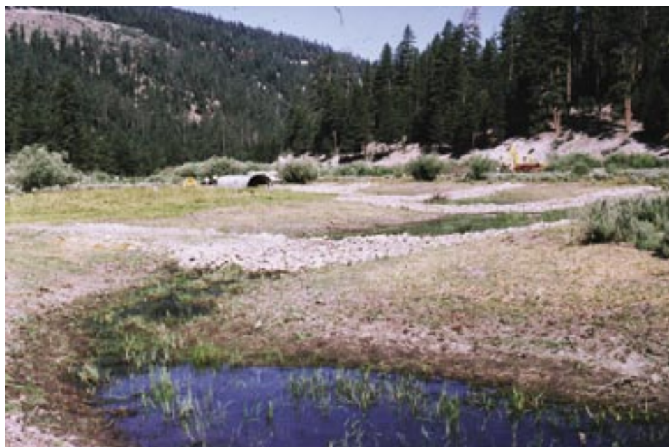
Figure A55. Looking upstream at the rehabilitated channel during placement of the culvert in 1988.

Aquatic Organisms: Thomas Creek is an important spawning stream for Goose Lake Redband Trout. They need passage during their spring spawning migration, as well as during summer low flows when they may move to find deep pools with cool water or refuge from predators.