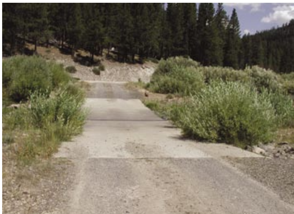
Figure A52. Looking north at the Mesman ford.

Since at least the 1980's, objectives for the crossing have included preventing upstream migration of a large headcut moving up through the valley. Today the crossing is part of a restoration project aimed at restoring flood plain and channel connections in the incised reach of stream. The roadway is elevated about 2 feet above stream grade. Class VII riprap faces both the upstream and downstream sides. For specific dimensions, see figure A57.