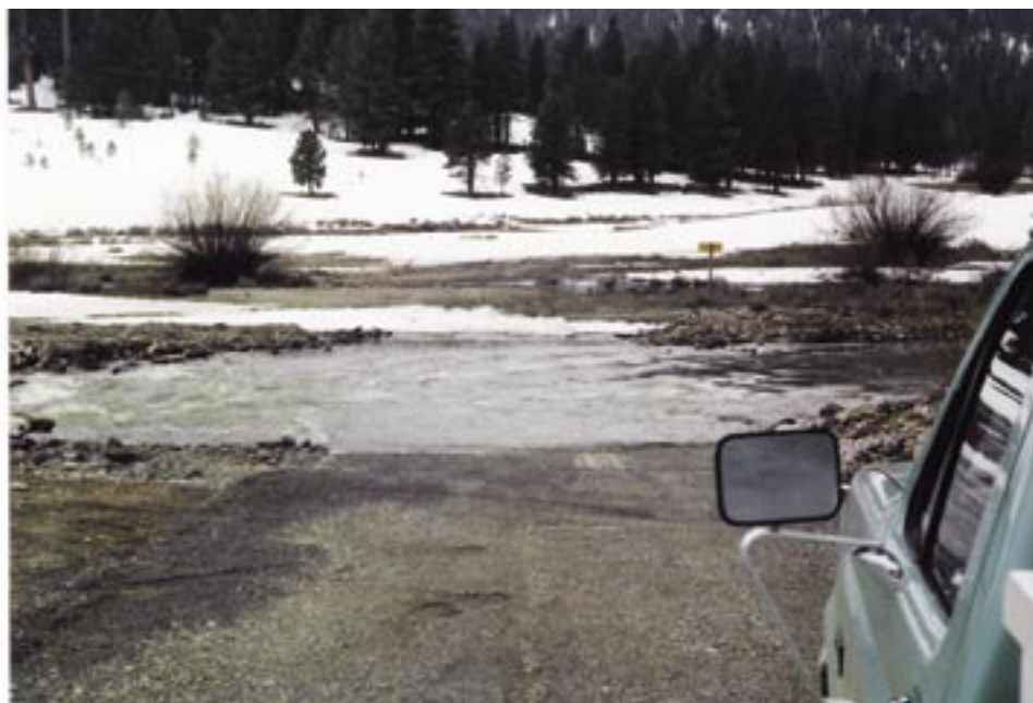
Figure A58. Looking south across the submerged ford in January 1999. The road dip beyond the ford is conveying flood plain overflow.

crossing, a flood plain overflow channel was rerouted toward the ford. There is a flood-plain culvert under the road in that vicinity in case ditch capacity is exceeded. About 150 feet south of the crossing, there is a grade sag in the road surface to permit flood plain flows to overtop the road (figure A58).