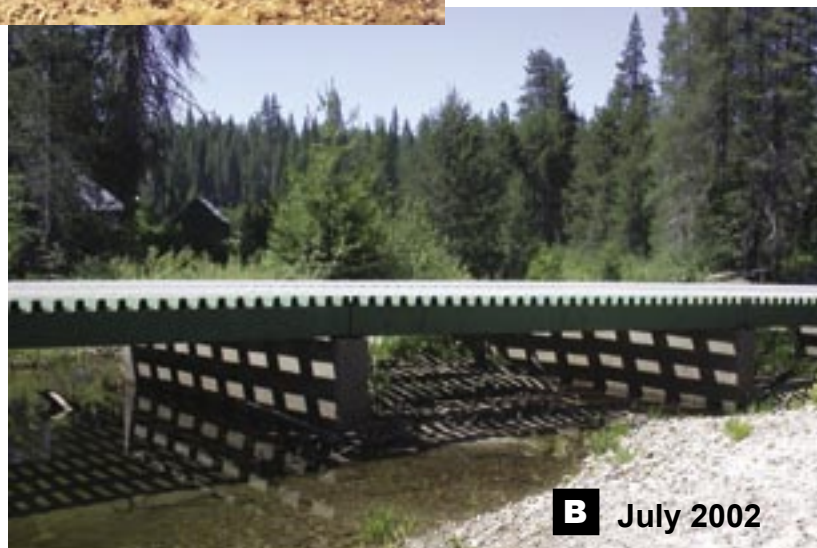
Figures A138a and A138b. Looking downstream at the Jones Wreckum Bridge. A138a. Bridge inspection photo.