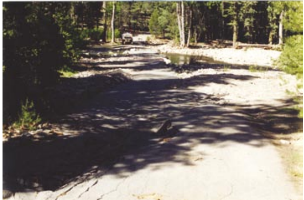
Figure A133. Capps ford after the 1997 flood. Flood flows spread out across the entire valley and road is washed out on far side.