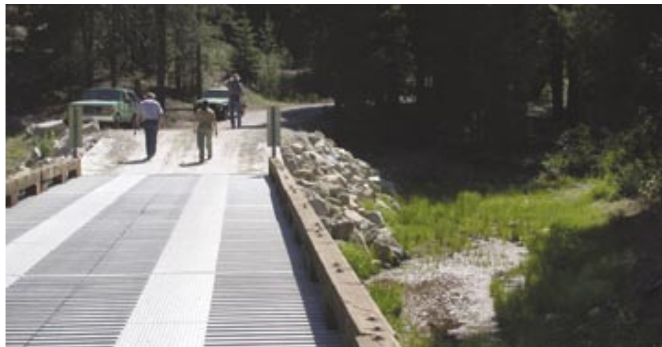
Figure A136. Note concrete abutment with riprap, grating with tire runways, and wood curbs.

On January 1 2006, the bridge underwent a flood estimated to have an 85-year return interval. Large amounts of debris were caught under and on the bridge, and sediment accumulated around the structure as a result. Perhaps due to sediment accumulation upstream of the bridge during the flood, flow spread over the entire flood plain and has concentrated into two principal channels, one on either side of the flood plain. Maintenance work will include debris removal and in-channel work to confine low-flow to a single channel and remove some sediment deposits.