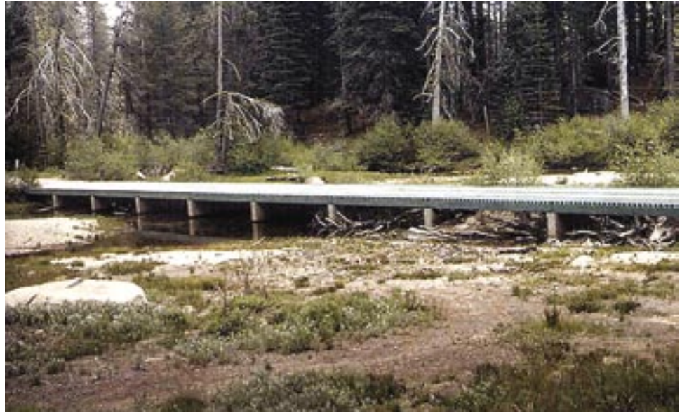
Figure A137. Looking downstream at Capps bridge with debris trapped under deck, 1988.

This reach is flatter than Capps, bed material is finer (coarse gravels about 1 to 1½ inch), and the channel appears to be more stable. The bridge is located just upstream of a right-angle bend in the river and crosses the point bar leaving enough space for natural adjustments in sediment storage. Woody debris trapped under the bridge on the point bar side has not been removed, and has contributed to sediment accumulation (figure A137). Both upstream and downstream bars have enlarged since the 1970s (figures A138a, A138b). Nonetheless, comparing current channel conditions to Brink's 1974 description, the channel does not seem to have changed much, indicating that the stream is functioning naturally and is stable. None of the pier footings are exposed.