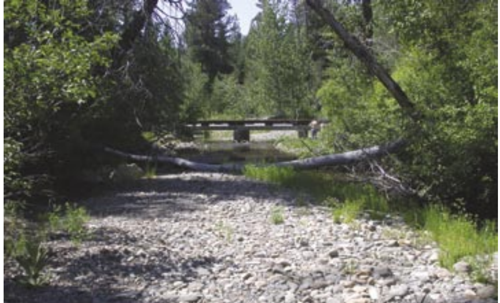
Figure A134. Downstream view of Capps bridge showing cobble bars and debris in channel.

plain that is about 2 to 3 feet lower than the ground adjacent to the stream elsewhere. Even in undisturbed upstream reaches, abandoned channels and side channels are evident across the valley bottom. Clearly the stream is dynamic and prone to shifting across the valley floor.