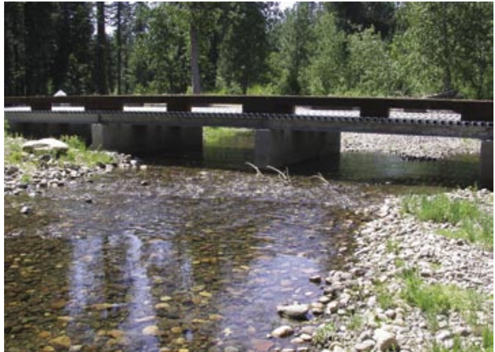
Figure A132. Looking downstream at the Capps low-water bridge. July 2002.

This low-water bridge was constructed in 1998 as an Emergency Relief for Federally Owned Roads (ERFO) project (figure A132). It replaced a vented concrete slab ford that plugged and caused substantial channel and flood plain damage during the 1997 flood. Because the old ford blocked sediment transport during high flows, it had caused dramatic channel aggradation and flood plain erosion. To reestablish channel stability at the site, the designers decided to bridge the entire flood plain, and to provide for overflow in case of debris jamming. The bridge has 13 concrete piers set on bedrock and the deck is square steel tubing with two smooth steel plate runways.